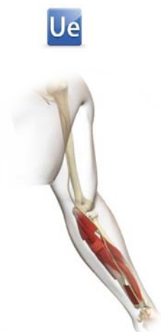
ART® Upper extremity