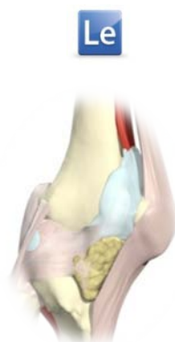
ART® Lower extremity